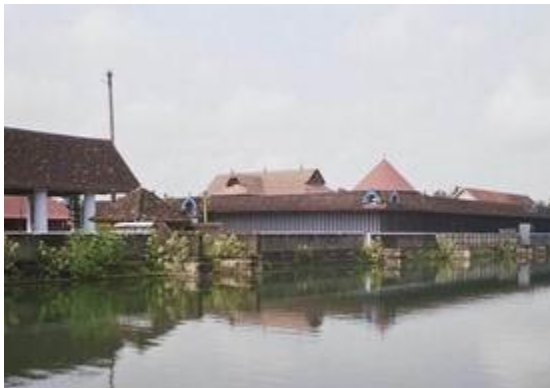
Hindu epic Ramayana.

Koodalmanikyam Temple or Koodal Manikyam Bharatha Temple is an ancient Hindu temple located in Irinjalakuda, a small town in Thrissur District of Kerala . Kudal Manikkam Temple is the only temple in India dedicated to Lord Bharata, the brother of Lord Rama . He is worshiped here as Lord Sangameshwara. Sangameswara is a Sanskrit word which in Malayalam translation means Koodalmanickyam. Koodalmanikyam Bharatha Temple is also one of the four temples in Kerala which form a set known as Nalambalam (Four Temples), of which each temple dedicated to the 4 brothers Rama, Bharata, Lakshmana and Shatrughna of the