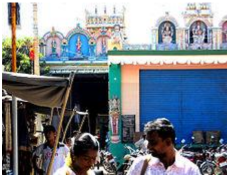
Bhagavthy Amman temple, Kanyakumari.

Devi Kanya Kumari , known as Kumari Amman (the virgin goddess) is one of the forms of Devi . She is popularly known as "Bhagavathy Amman". Bhagavathy Amman Temple is located in Kanya Kumari (formerly Cape Comorin) on the confluence of the Bay of Bengal , the Arabian Sea , and the Indian Ocean . She is also known by several other names, including Kanya Devi and Devi Kumari .